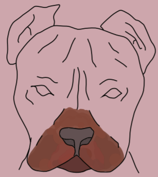
AMERICAN PIT BULL TERRIER

The five most popular breeds used in fights worldwide