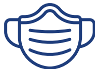
MANDATORY USE OF FACE MASKS